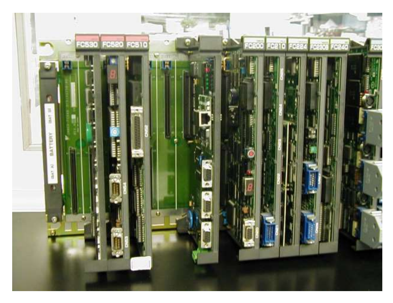
A Yasnac i80 Model A with our Mxl80 Memory Card installed in the center slot labeled FC120 (with the 3 DB9 Ports and the Ethernet Port and no label at the top).

Note: To enable the Ethernet connection on our MxI80 board (and to set up the serial port COM1 for connection to the Yasnac Port A) please consult the UMI installation manual. Use the utility "LocateIP" found on our web site or on the NetDNC CD in the 100 Utilities folder.