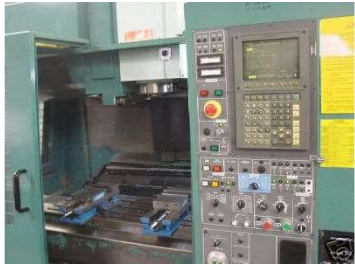
A Yasnac i80 Version A Controller